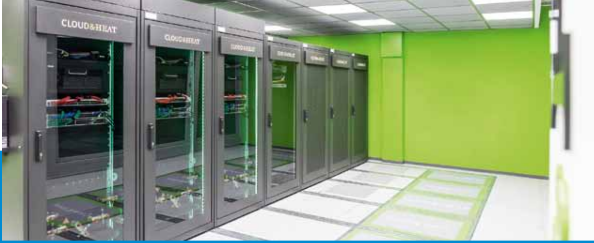
19-inch customized rack for CLOUD&HEAT